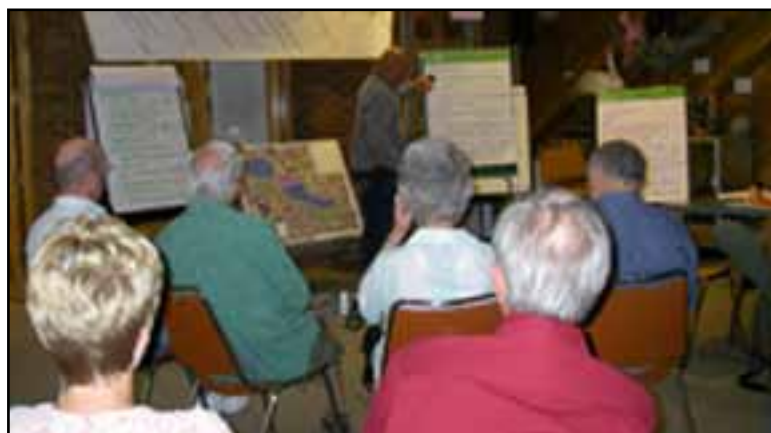
A work session participant presents brainstormed ideas

Additional opportunities for the public to comment and provide input will be announced in future planning updates and on the website.