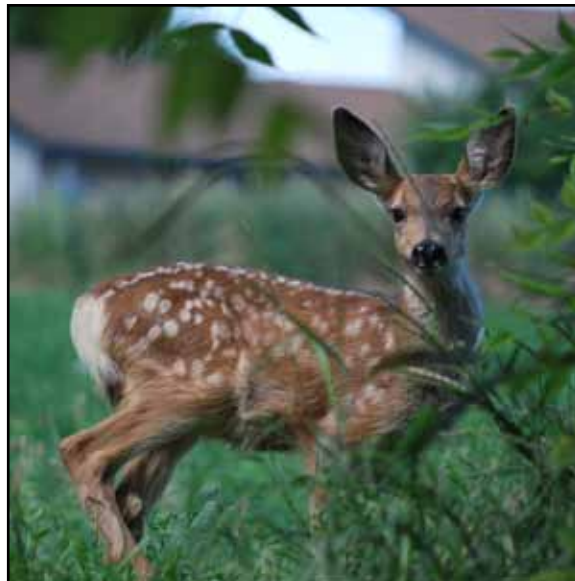
Mule deer fawn

Many commenters "voted" to keep the lake open to particular recreational opportunities, but the planning process is not a vote. Because the plan must comply with relevant law and policy, if an idea proposed by many commenters violates law or policy, it cannot be included in the plan. On the other hand, a suggestion made by just one commenter that complies with law and policy might be included.