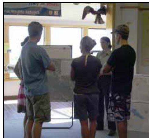
Open house attendees talk with a Refuge staff member

on September 23-25 to involve stakeholders in brainstorming possible solutions to key management issues.